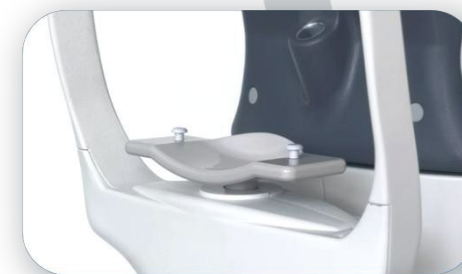
Electric chin rest