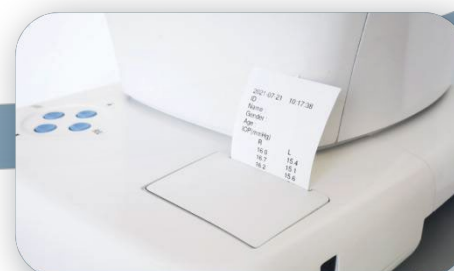
Print report Auto paper cutting