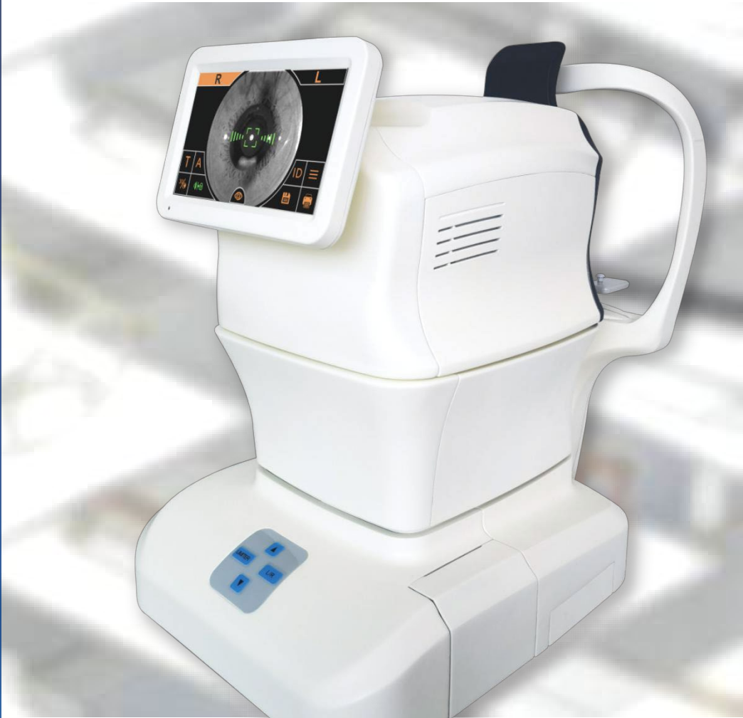
Non-contact tonometer NCT-5000A/B

QUICK SPEED 3D AUTO-TRACKING AUTO MEASUREMENT SOFT AIR PUFF, SAFTY, PACHYMETER+TONONMETER