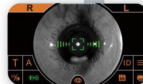
Auto alignment Auto focus

SK-5000B supports corneal thickness measurement More functions